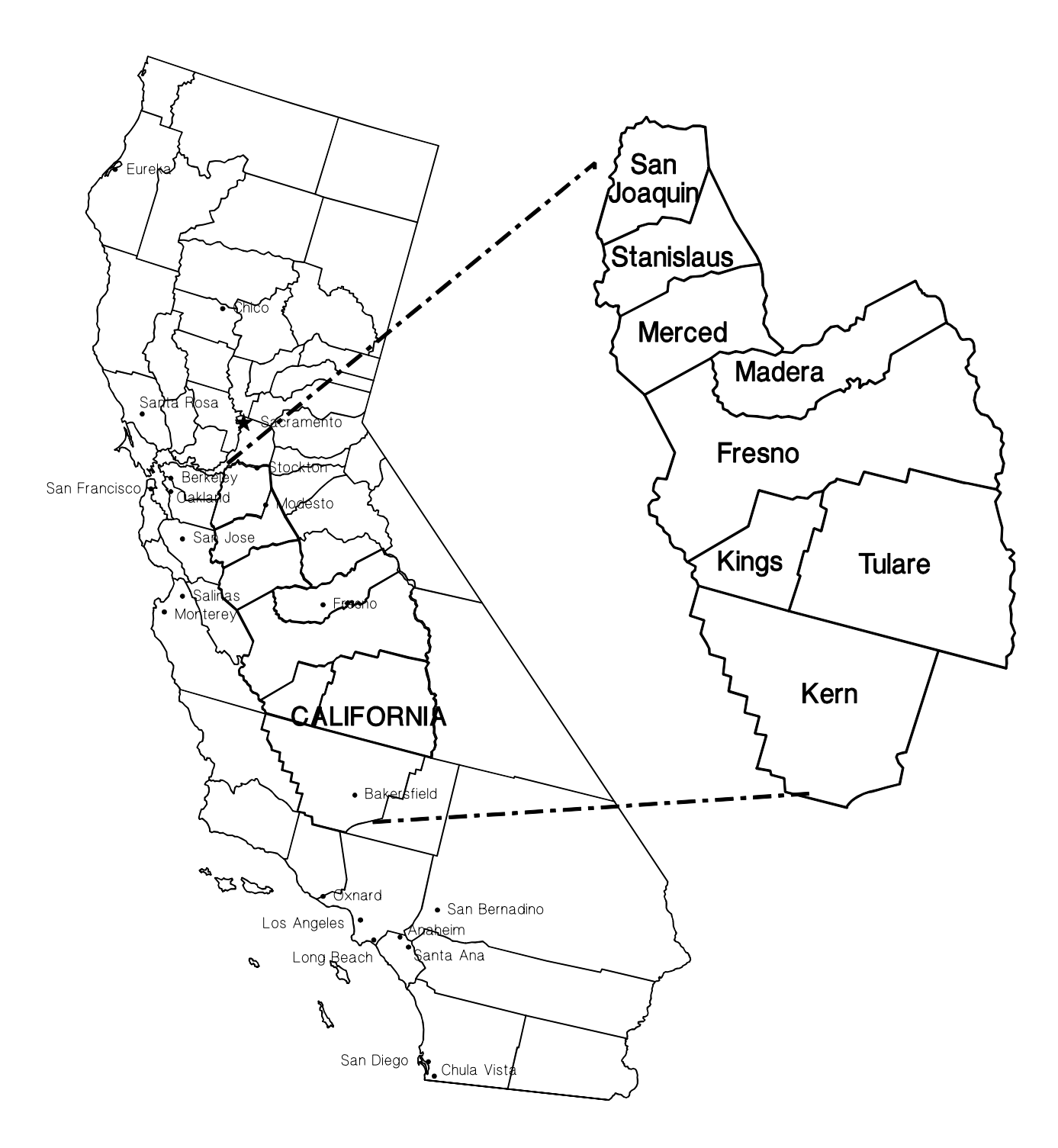
Figure 3-1 San Joaquin Valley Unified Air Pollution Control District Boundaries